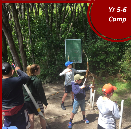
Yr 5-6 Camp