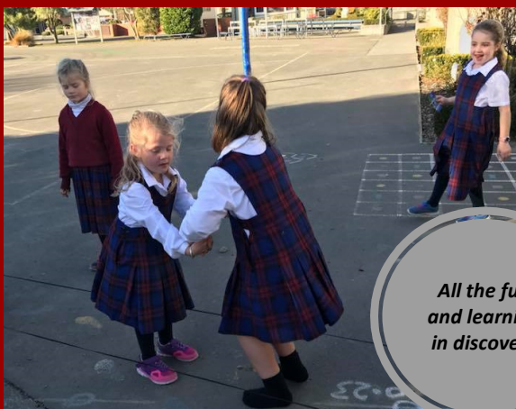
All the fun and learning in discovery