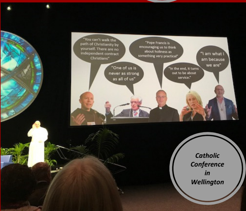
Catholic Conference in Wellington